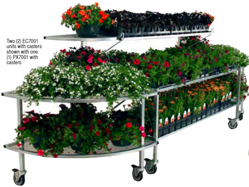
Two (2) EC7001 units with casters shown with one (1) PX7001 with casters