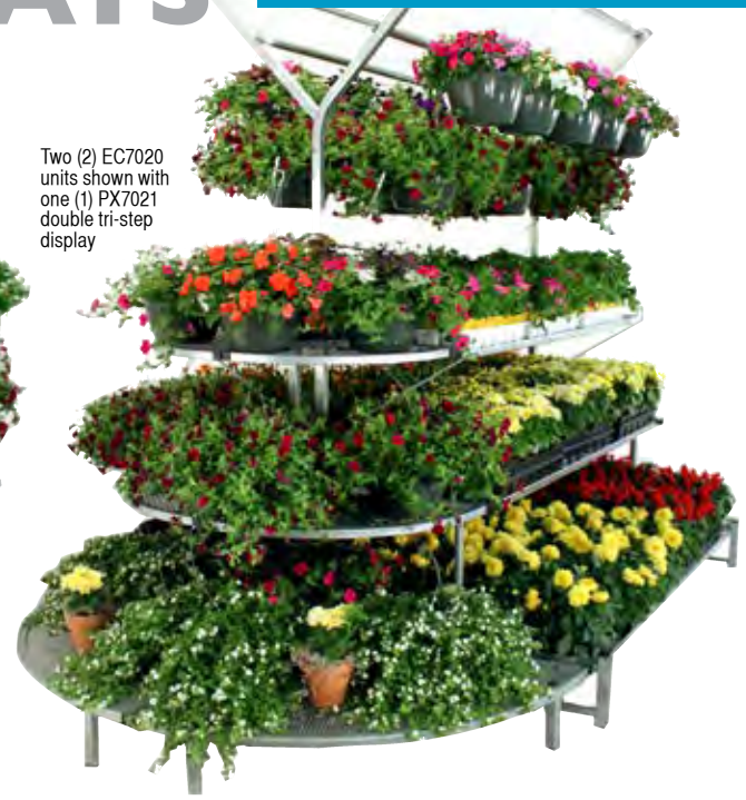
Two (2) EC7020 units shown with one (1) PX7021 double tri-step display

Our new end caps for the Evolutions series are configured to match up with their corresponding display! They still feature expanded metal benchtops, galvanized steel construction for strength and durability and are now also available with optional casters. Use them by themselves in many configurations or with displays to feature and merchandise your product. End caps are also great for sale items or as a focal point from which you can attach signage.