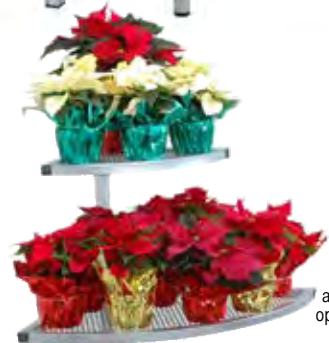
EC7020 as shown with optional casters