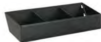
$95 bin plus 2 dividers