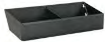
$80 bin plus 1 divider