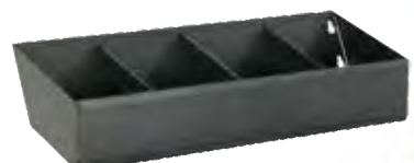
$110 bin plus 3 dividers