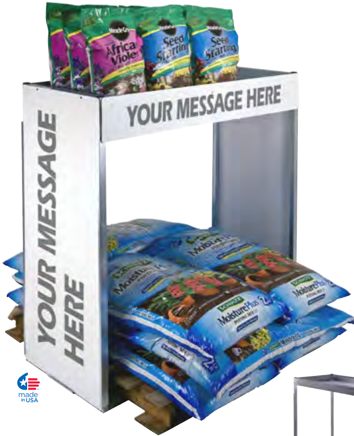
PB3000 with sign panels

Our new pallet bridge display provides an elegant solution to cross-merchandise products that are complementary to your palletized goods. Graphic panels (not included) simply slide into the side supports while mounting holes on the tray face easily accept most types of rigid signage panels. The galvanized steel frame fits over most standard pallets and the upper tray features flattened expanded metal to hold large and small products.