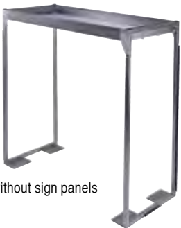
PB3000 without sign panels