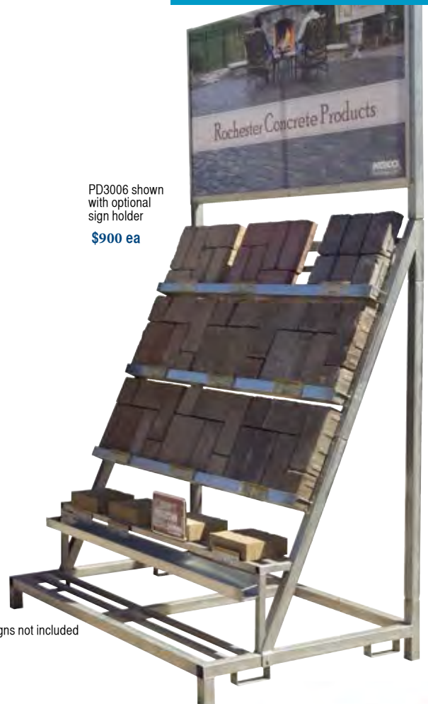
PD3006 shown with optional sign holder

We're paving the way for increased sales with our attractive landscape paver display unit. Provide your customers with a convenient shopping experience when you purchase this easy-to-browse display. Welded supports and 2" galvanized steel construction ensure this unit can hold a heavy load. Choose our optional sign holder to provide ideas and inspiration to your clients as well as to create timely messaging, adding even more value to your display.