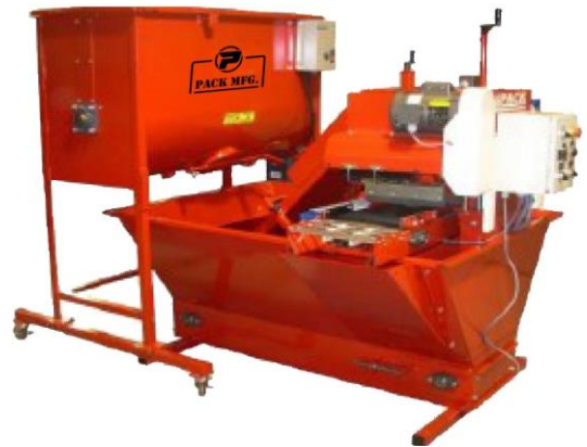
Optional Mixer Combination for Increased Volume & Production